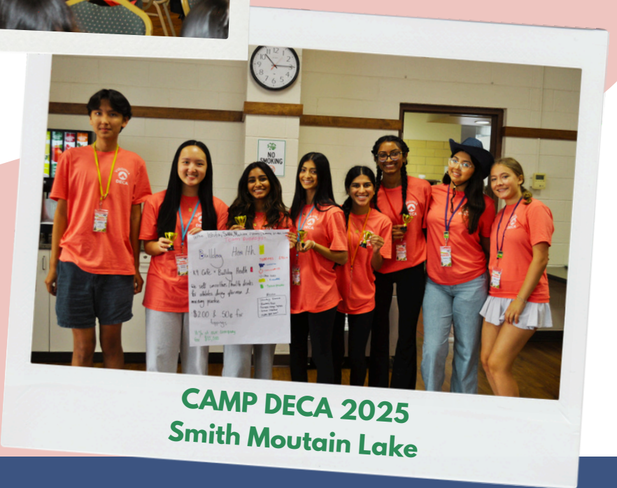
CAMP DECA 2025 Smith Mountain Lake