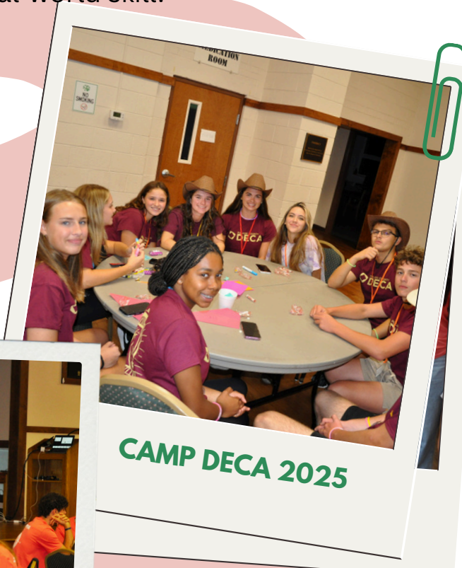
CAMP DECA 2025